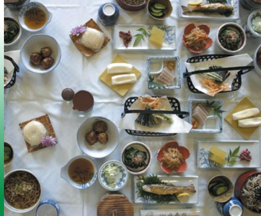
Typical Lunch in Yuzurihara including daikon radish and other vegetables rich in Hyaluronic Acid