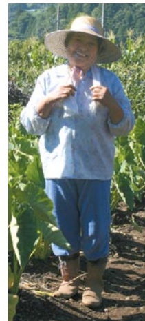
Yuzurihara Villager farming in the sun

The first morning in Yuzurihara we made a quick stop for photographs at the etched stone monument at the entrance to Yuzurihara, and then we visited the fields where crops were being grown in the middle of summer. Corn, taro root, okra, red onions, tomatoes, cucumbers, melons and potatoes were being grown and harvested. Up to this point there were no surprises. A few people were working in the fields next to their homes on steep slopes where the traditional rice crop could not be grown.